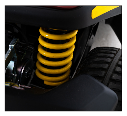
CTS Suspension on Front and Rear