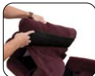
ZIPPERS TO ACCESS FIBER FILL STUFFING