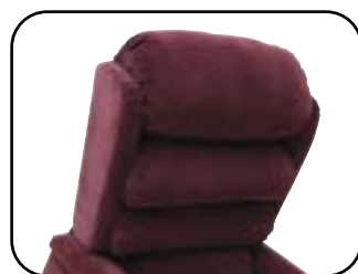
WING BACK DESIGN