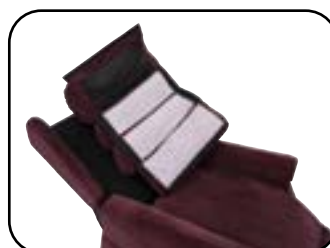
REMOVABLE / ADJUSTABLE BACK CUSHION