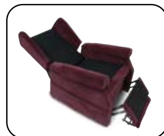
BACK AND CHAISE CUSHIONS REMOVED