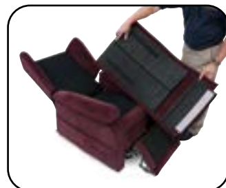
REMOVABLE CHAISE PAD