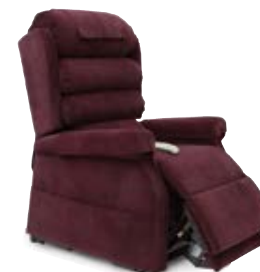
SHOWN WITH STANDARD HEAD AND ARM COVERS