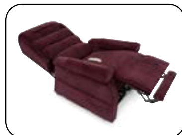
FULLY RECLINED WITH BACK AND CHAISE CUSHIONS