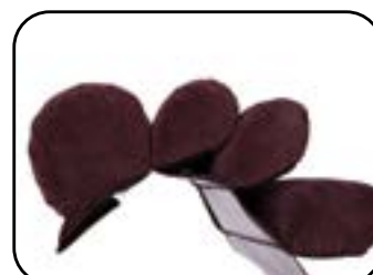
INDIVIDUALLY TETHERED PILLOWS