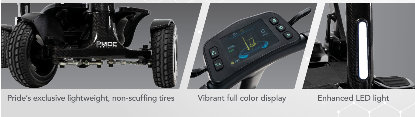
Pride's exclusive lightweight, non-scuffing tires