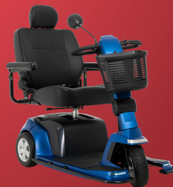
Infinite position tiller lever (mech lock)