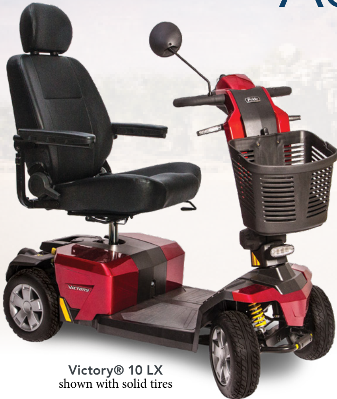
Victory® 10 LX shown with solid tires