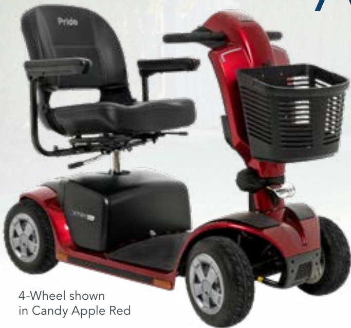
4-Wheel shown in Candy Apple Red