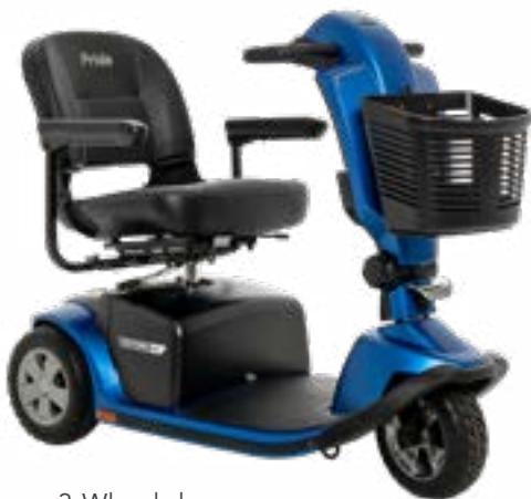
3-Wheel shown in Ocean Blue