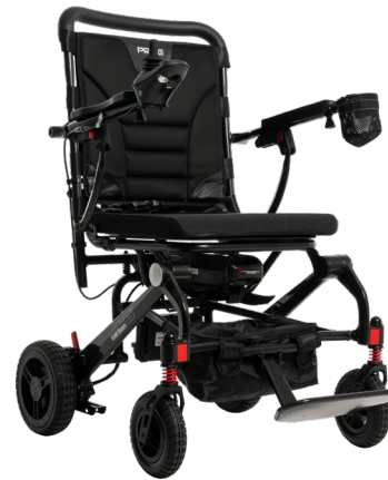
FDA Class II Medical Device 1