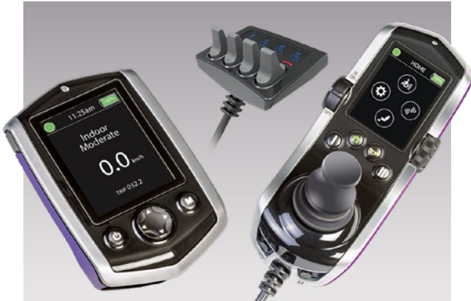
Q-Logic 3 (comes standard with Bluetooth®)