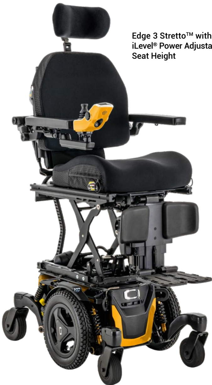
Edge 3 Stretto™ with iLevel® Power Adjustable Seat Height

Q-Logic 3 Advanced Drive Controls are user-friendly and highly customizable. The Q-Logic 3 EX Joystick comes standard with wireless Bluetooth programming through Windows devices and Bluetooth access to computer, tablet and phone functions. Clinic Mode allows for quick setup of multiple input devices during client evaluations and automatically assigns drive modes to input devices. The Q-Logic 3 iAccess features programmable push button and toggle options for customized seating access.