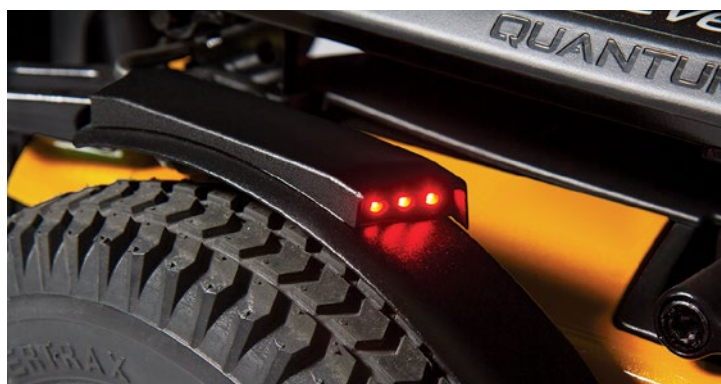
LED fender lights Standard on Edge ® 3, Edge 3 Stretto ™ and Q6 Edge ® Z Optional on Q6 Edge ® 2.0 and Q6 Edge ® HD