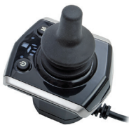
Q-Logic 2 EX Stand-Alone Joystick (SAJ) / EX Attendant Joystick