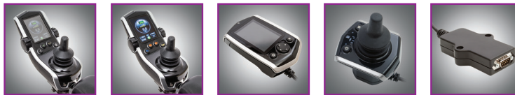
Q-Logic 2 EX Joystick Q-Logic 2 EX Joystick with Lights Q-Logic 2 EX Enhanced Display Q-Logic 2 EX Stand Alone Joystick / EX Attendant Joystick Q-Logic 2 Specialty Controls Interface Module