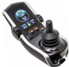
Q-Logic 2 EX Joystick for LED lights