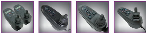
NE and NE+ PG VR2 (4-key) PG VR2 (6-key) PG VR2 (9-key)