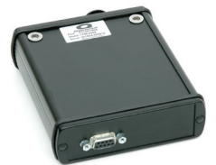
Environmental Control Unit (ECU)