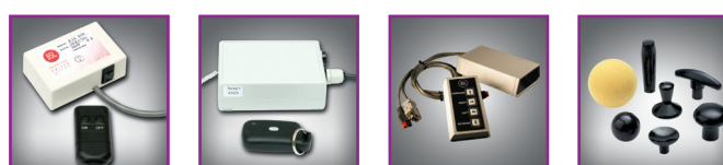
ASL Remote Stop Switch Switch-It Remote Stop Switch ASL Remote Attendant Control Joystick Handles