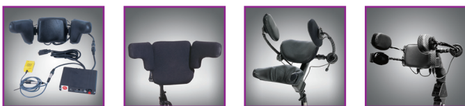
ASL 3-Switch Head Array Switch-It Head Array (3, 4 or 5 switch) 3-Switch Stealth Ultra Head Array Stealth i-Drive™ Tri-Array