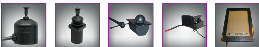
ASL Micro Extremity Control Switch-It Proportional Joystick Stealth Mushroom Joystick ASL Rim Control Switch-It Touch Drive