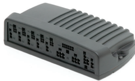
Advanced Actuator Module (AAM)