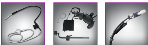
Therafin Whisper-Lite Sip-N-Puff Hardware ASL Sip-N-Puff Head Array Switch-It Sip-N-Puff with Opti-Stop