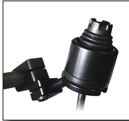
Precision Mini Proportional (PMPJ)

The Stealth Products line of joysticks are some of the most precise, robust, multiple axis, proportional controllers available for use on a power wheelchair. Through the use of i-Drive technology and software, the joysticks reaction to movement can be fine-tuned so the slightest change offers precision control translated to a voltage signal output.