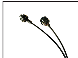
Fiber Optic Switch

i-Drive Eclipse Tray with capacitive or fiber optics proximity sensors includes the 360° mount for the Gatlin. This allows for mobility or functional independence for individuals with low head control.