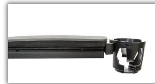
Cup Holder (front mounted)