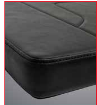
TRU-Comfort Sport 4 back